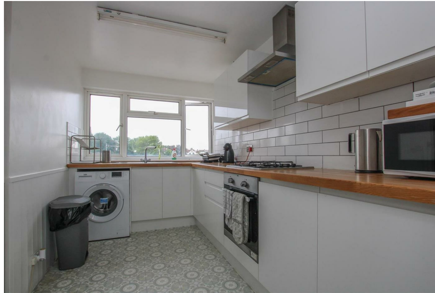
67 Mayfield Gardens, Brentwood, CM14 4UN

TOTAL FLOOR AREA: 671 sq.ft. (62.3 sq.m.) approx. Measurements are approximate. Not to scale. Illustrative purposes only. Made with Metreps CO23